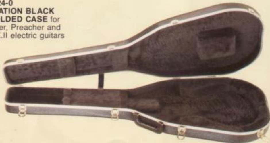
9124-0 OVATION BLACK MOLDED CASE for Viper, Preacher and U.K.II electric guitars