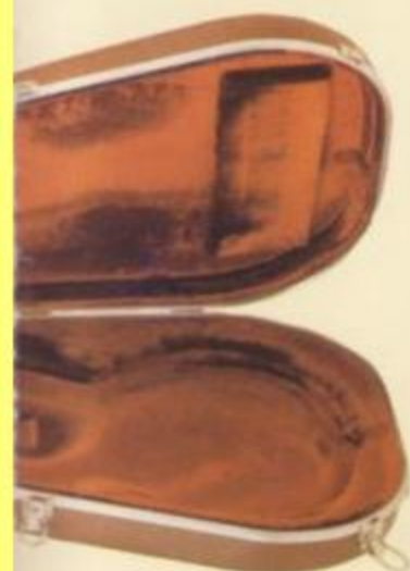
9123-0 DELUXE OVATION MOLDED CASE for Magnum 3 and 4 Basses