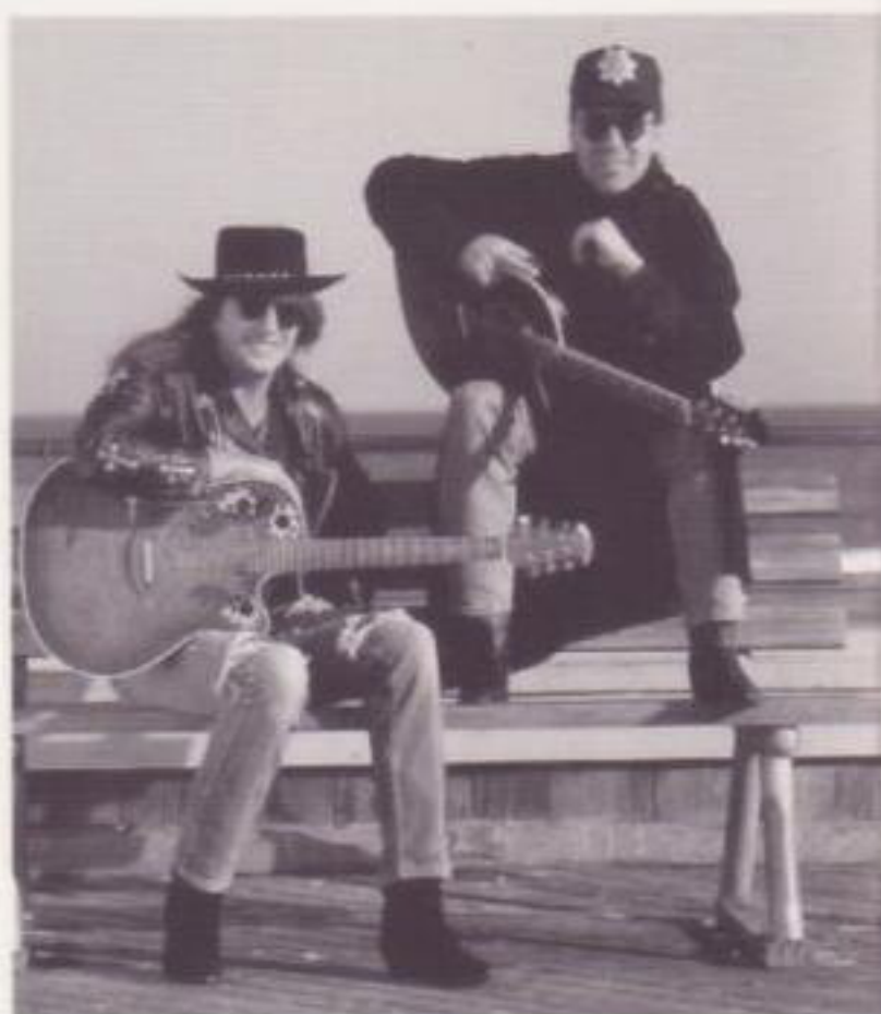
Ovation is the common ground between rocker Richie Sambora, left, and jazz guitarist Al Di Meola.

Ovation Instruments has introduced this Limited Edition Elite guitar in honor of Ovation's 30th anniversary. A display of classic Ovation guitars is included in the Old State House's "City of Firsts" exhibit which runs through November 30.